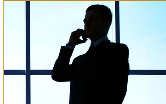
Threats That Keep CEOs Up at Night