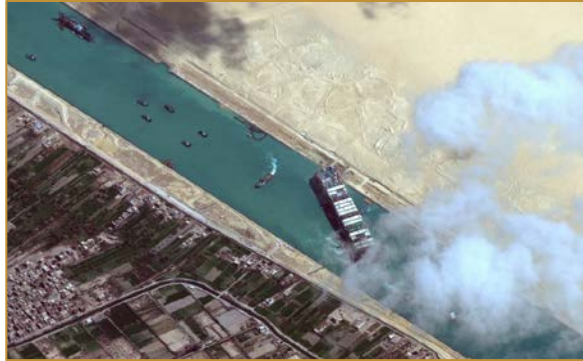
Ever Given Blockage Wreaks Havoc on Supply Chains, Addresses Need for Risk Management