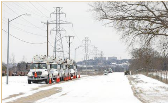
Texas Power Outage Crisis Serves as Lesson in Risk Management