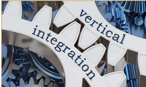
Captive Insurance as a Second Profit Center