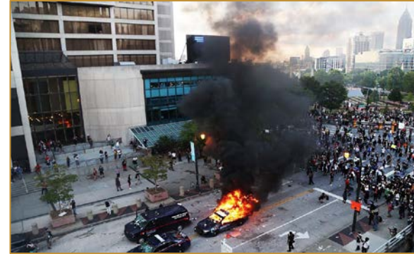
Captive Insurance Offers Solution as Businesses Face the Aftermath of Civil Unrest