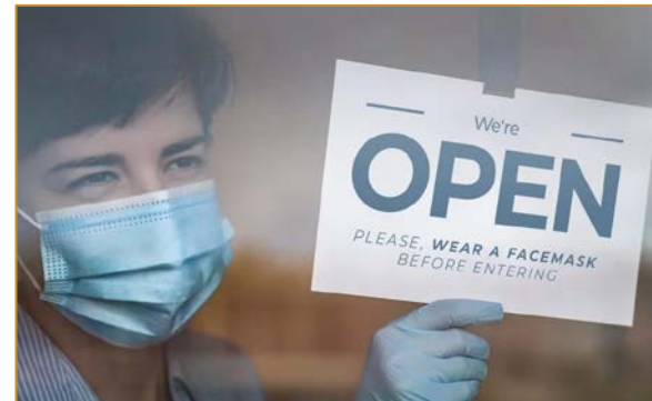
As Coronavirus Threatens Operations, Businesses Find a Cure in Captive Insurance