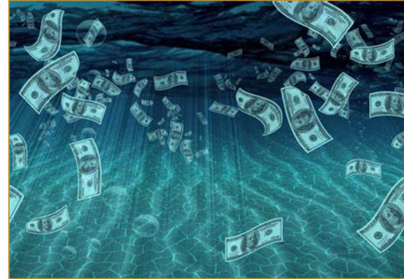
Sunk Costs That Are Drowning Businesses